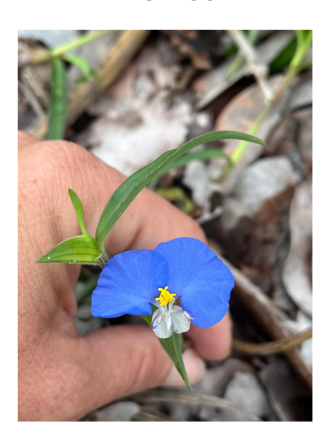
Whitemouth dayflower (Commelina erecta)

IRC has an E-Trade account. Please contact us about giving gifts of stock.